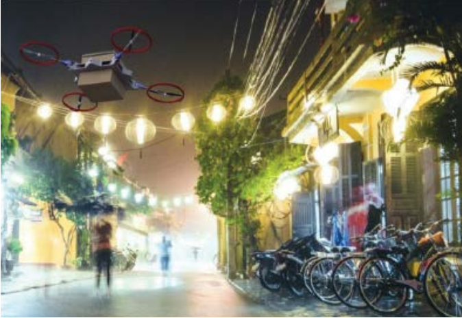
Concept rendering of the ALFRED (Automated Leftover Food Recovery for Extended Distribution) drone.