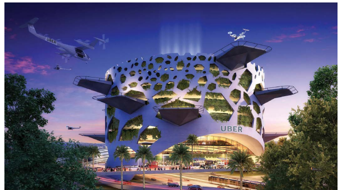
Humphreys & Partners Architects high rise Uber Elevate Skyport concept design (Humphreys & Partners Architects graphic)

conditions, pilot input would be required to ensure safe landings and takeoffs. Future research for this project will include wind tunnel testing at NASA Ames Research Center, allowing for the comparison of computer simulations with the test data.