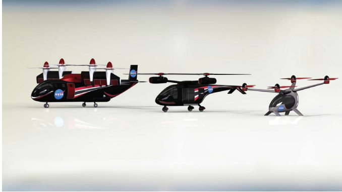
NASA reference models (L-R): Reference Model 3 (14 passenger tiltwing), Reference Model 2 (six passenger side-by-side rotors) and Reference Model 1 (personal quadrotor).

Wagner assessed the capabilities of the fully-electric NASA Reference Model 2 (the side-by-side configuration) and determined that the side-by-side showed great potential as a VTOL aircraft. The aircraft met the minimum performance requirements set for VTOL technology.