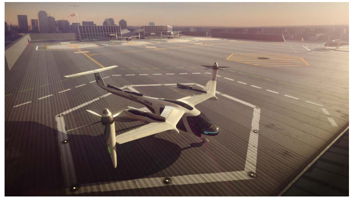
Uber Elevate Electric Common Reference Model eCRM-001.